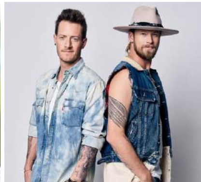
Florida Georgia Line