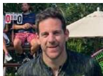
Juan Martin Del Potro